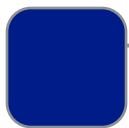
PMS REFLEX BLUE